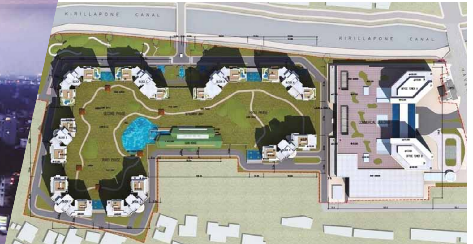
Plan view of Havelock City comprising both residential and commercial components

Experience the convenience of exploring the city whilst having the comfort of knowing that redefined luxury is at arm's length.